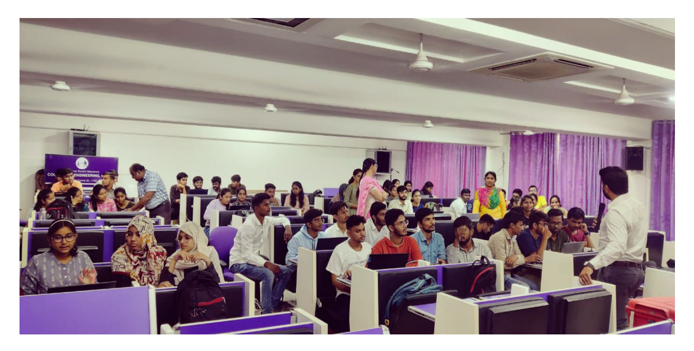
Participant students in interaction with trainer and co-ordinators