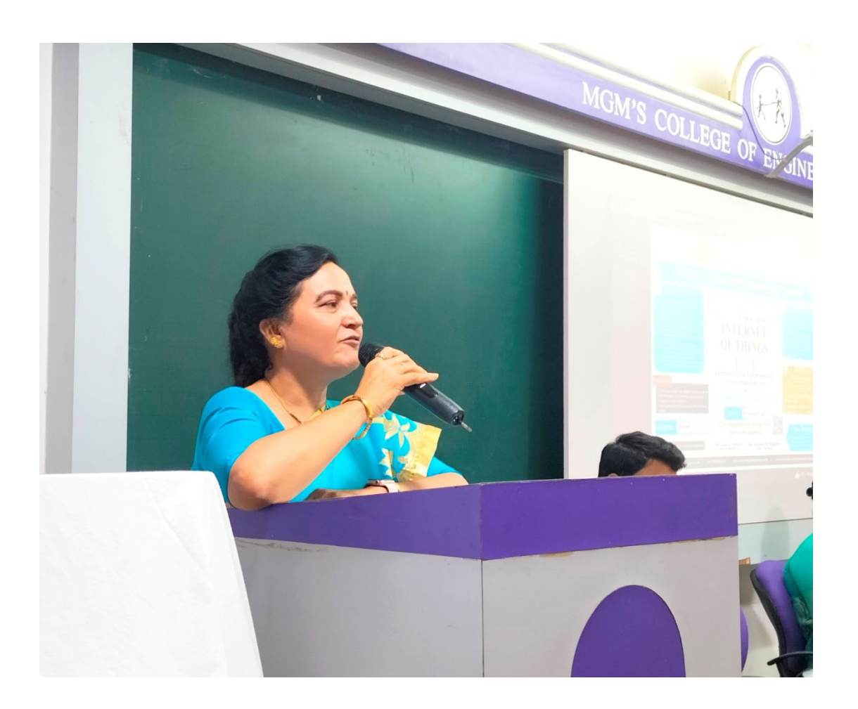
HOD's address to the participants