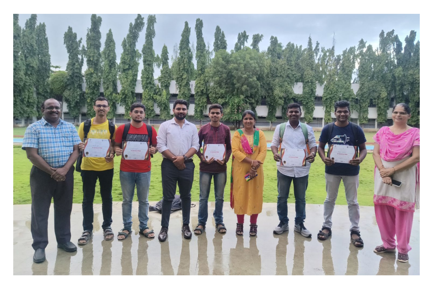
Runner up Team with trainer and co-ordinators