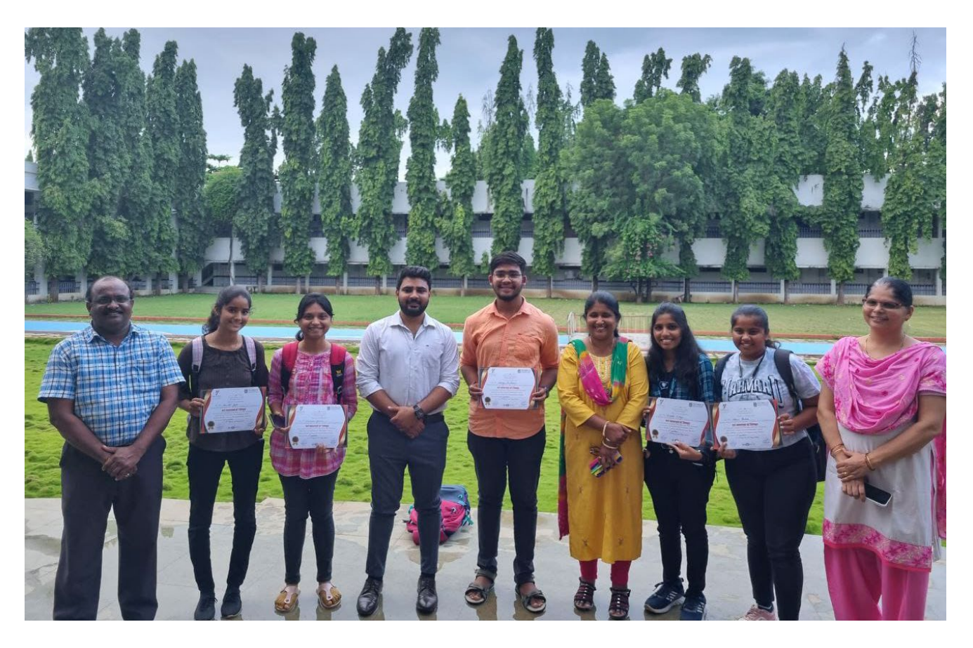
Winning Team with trainer and co-ordinators