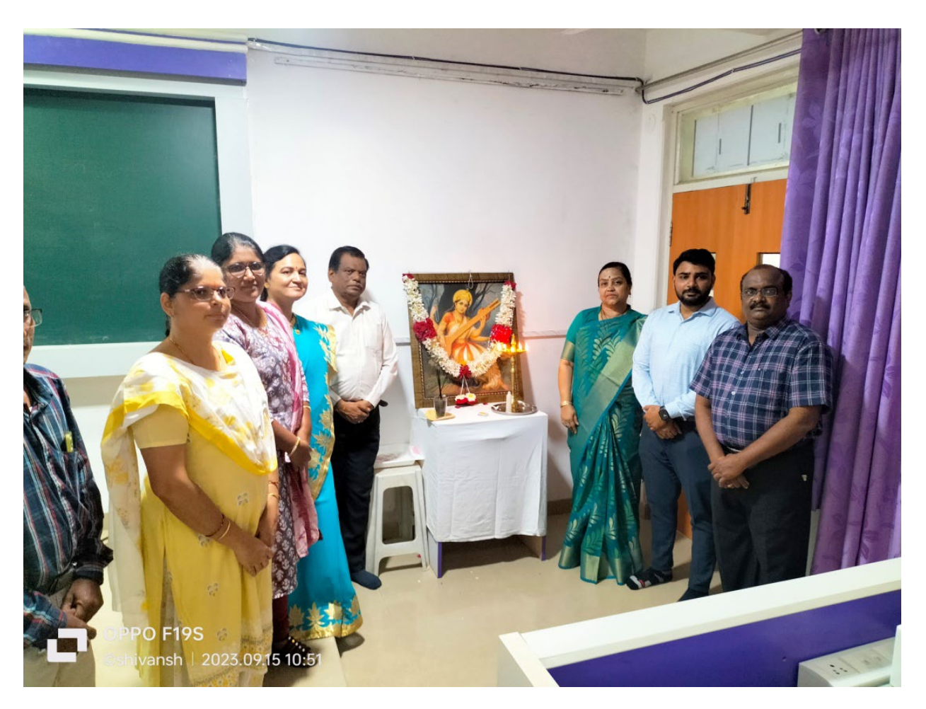
Inauguration of the workshop by lamp lighting and Saraswati vandana